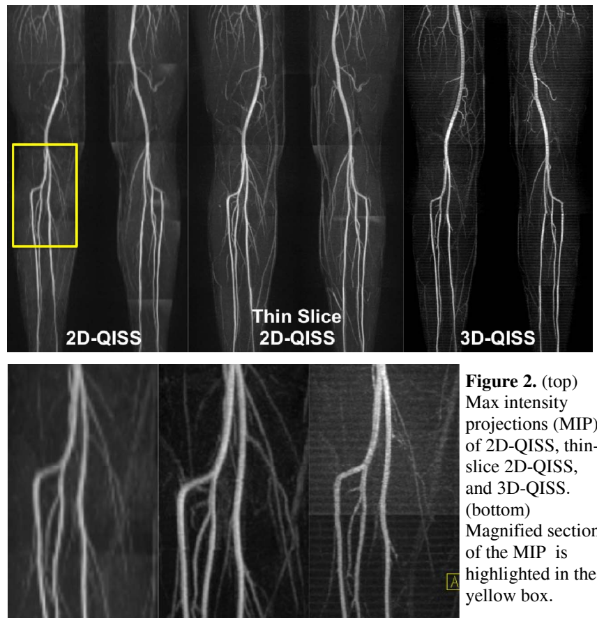
Figure 2. (top) Max intensity projections (MIP) of 2D-QISS, thin-slice 2D-QISS, and 3D-QISS. (bottom) Magnified section of the MIP is highlighted in the yellow box.

References: 1) Edelman et. al., MRM, 2011. 2) Hodnett et. al., Radiology, 2011. 3) Hodnett et. al., AJR, 2011.