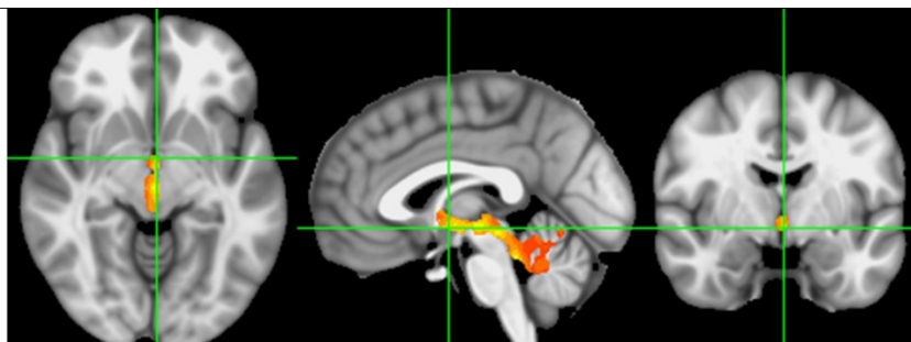
Fig. 2. Brain network associated with hypothalamus showing significant treatment effect of the intervention as assessed with a 3-way ANOVA model at p < 0.05 and cluster size of 40 voxels.