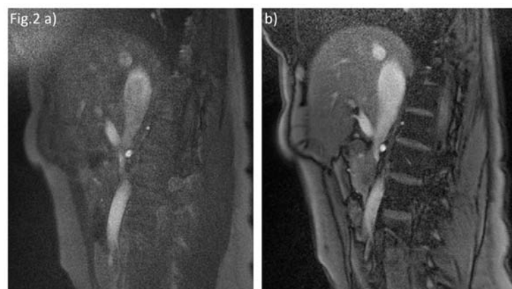
In-vivo data acquired in one volunteer from; a) conventional cine PCMR, b) r-r interval averaging spiral PCMR