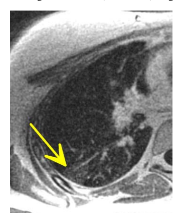
Fig. 2: Patient 2, diagnosed with an acute myeloid leukemia, 71 days after hematopoietic stem cell transplantation. The arrow marks ground glass opacity as a sign of local edema, indilung diseases. Scan parameters were Conclusion - Traditionally, computed tomography is the 1.5 T, TE/TR/ \alpha /dwell=70 \mu s/3.5 ms/ 10^{\circ}/1.56 \,\mu s, voxel size 0.7 mm, 116276, of number spokes TA=6.8 min.

Results - Figure 1 shows patient 1 (age 22, female) with a small focal lesion (4 x 2.5 mm) in agreement with the diagnosis of a fungal infection. The lesion is clearly delineated and separable from blood vessels. In a follow up examination 7 weeks later, after posaconazole treatment, the lesion was no longer detectable (not shown). Figure 2 shows an UTE image of patient 2 (age 13, female) with