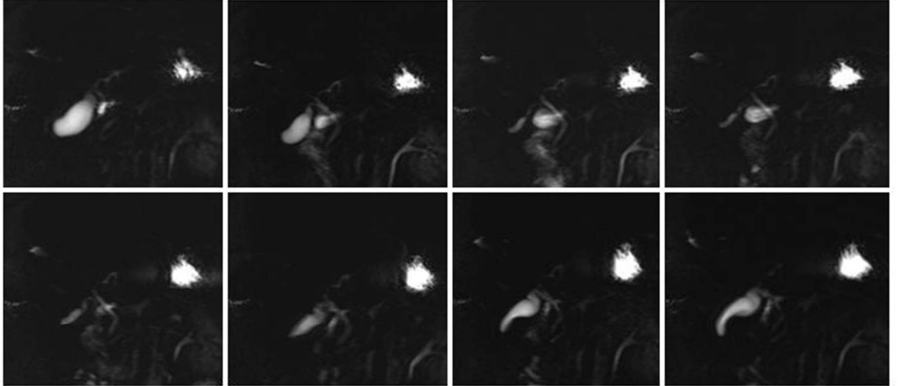
Figure2: Dynamics of gallbladder contraction after Sincalide injectionof 3min (group1) vs 30min (group2

Results: No adverse events were observed during the entire study. Maximum contraction of GB occurred at 10.8\pm2.0 minutes postinjection in group 1 and at 11.5\pm2.2 minutes post injection in group 2. The time of maximum contraction revealed no significant difference (p= 0.68) between two groups. Dynamic pattern of GB contraction is more consistent in group 2; gradual "refill" of GB was observed in all individuals during a scanning period of 60min. Mean CBD diameter in group1 before and after maximum GB contraction was 3.35\pm0.84 mm and 3.28\pm0.87 mm, respectively. Mean CBD diameter in group 2 before and after maximum contraction of GB was 3.32\pm0.60 mm and 3.15\pm0.70 mm. Non-parametric t-test showed no significant difference (p>0.05) between the two groups. Conclusion: Sincalide-enhanced MRCP is capable of providing functional dynamic information of GB contraction combined with excellent anatomic detail which is currently not available with any other imaging modality including nuclear medicine studies. The procedure is safe. Provided further evaluation in patients with GB pathology, Sincalide-enhanced MRCP may open the possibility for future combined morphologic and dynamic assessment of diseases of the GB in one examination.