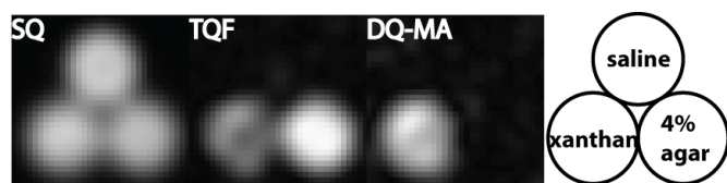
Figure 2: SQ shows signal from saline, agar, and xanthan gum whereas DQ-MA provides selective detection of signal from only the sodium nuclei in the macromolecular ordered xanthan gum. TQF shows signal from sodium nuclei with bi-exponential T_2 relaxation which provides a different contrast than DQ-MA. The images are not scaled equally.

Results and Discussion: The DQ-MA sequence eliminates signal from all environments in which the nuclear electric quadrupole moment interaction with the electric field gradients experienced is time-averaged to zero (i.e. both saline and agar – Figure 2). Signal is produced from only the xanthan gum phantom, implying the existence of non-zero \bar{\omega}_Q within this phantom (i.e. some microscopic order). The DQ-MA provides unique information relative to TQF where sodium signal is still present in the agar gel. The \tau value used in the DQ-MA sequence produces signal from interactions producing \bar{\omega}_Q values in the vicinity of 125 Hz. DQ-MA signal is only a small fraction of SQ signal resulting in images with poor SNR and spatial resolution. Nevertheless, signal from DQ-MA was observed throughout the human brain (Figure 3). One might expect differences in non-zero residual quadrupole interactions of sodium between gray and white matter, but this is not observed in the very low resolution images. Further research is necessary to quantify the distribution of \bar{\omega}_Q throughout the brain, its impact on tissue sodium concentration quantification and its variation in disorders that alter tissue microstructure.