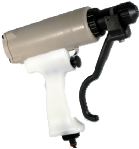
Figure 2: Prototype of the developed MR-compatible and x-ray transparent bone drill.

1 Department of Radiology, Charité - University Hospital Berlin, Berlin, Berlin, Germany, 2 MGB, Berlin, Germany