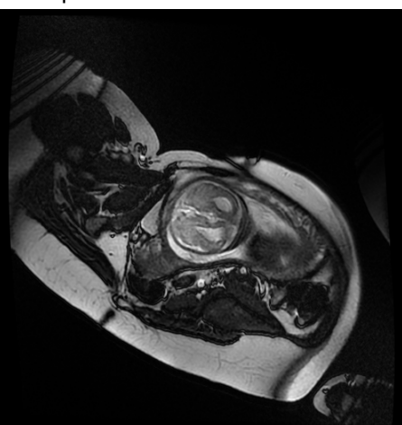
Fig 1. Combined fECG and mECG signal Fig. 2. fECG RVLA cine gated fetal image

Discussion Artifact from the imaging gradients was picked up on the ECG during imaging sequences which increased the minimum time required to reliably detect the fECG between each single shot imaging sequence. It was possible to gate to the fECG signal using rapid sequences but further work is required to automatically threshold the fECG signal after gradient induced artifacts to provide a reliable trigger in the MR.