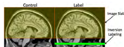
Figure 1 ASL acquisition scheme

Figure 3 shows the results of the comparison ( p < 0.005 ) between Controls and aMCI (Fig. 3a), mMCI (Fig. 3b) and AD (Fig. 3c). Important perfusion deficits in aMCI, mMCI and AD were found in posterior cingulate.