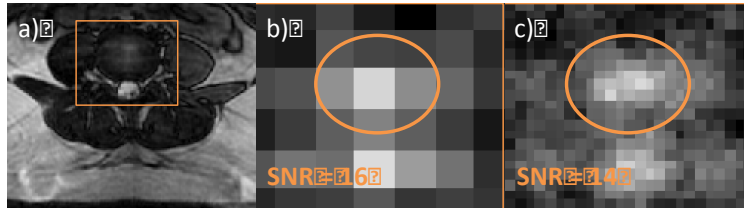
Figure 1 a) Anatomical reference and zoomed in Na MR image from: b) 32x32 filtered acquisition, c) weighted signal averaging.

Introduction Degeneration of intervertebral discs (IVDs) is nearly ubiquitous with aging, and is the leading cause of back pain. Clinically, the diagnosis and prognosis is based on observing morphological changes from T 2 -weighted MRI. The exact biochemical processes involved are still under investigation and the progress is often hampered by the lack of a reliable imaging marker for degeneration. The onset and progress of IVD degeneration is associated with a loss of glycosaminoglycans (GAG), whose concentration is directly related to that of sodium (Na + ) [1]. Wang et al. related the Na concentration in IVDs from Na MRI based on signal intensity [2]. However, the SNR requirement at the necessary resolution (at least 128x128) results in a relatively long scan time. Bansal et al. showed that weighted signal averaging might be used to improve SNR in Na MRI [3]. In this study, we develop sodium MRI with weighted averaging as a means to study IVD degeneration, with emphasis on monitoring age-associated changes.