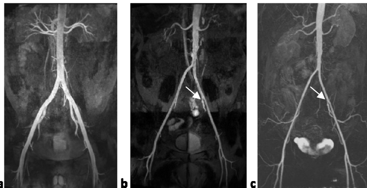
Figure 2. a) NC MRA of male volunteer. b) NC MRA and c) CE MRA of a patient. Both NC MRA and CE MRA exhibited good depiction of infrarenal aortic atherosclerosis and left internal iliac artery origin stenosis (arrows).