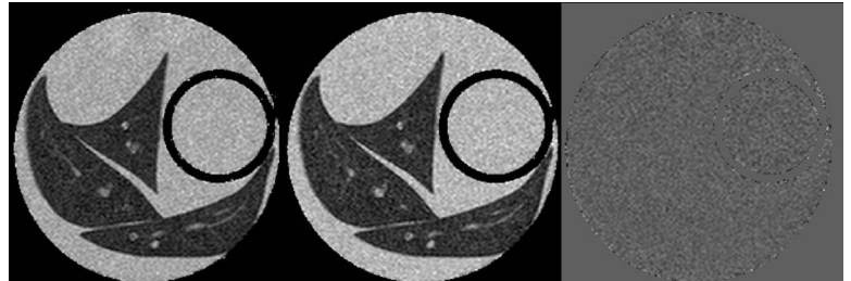
Figure 1. Parametric ADC maps from diffusion weighted images without (left) and with (middle) fat suppression. Internal reference vial containing PBS shown adjacent to the liver specimen. Subtraction image is shown to the right.

Conclusion: In a mouse model of fibrosis, in the absence of steatosis, slight differences between ADC values derived with and without fat suppression were measured. No significant correlation between the differences in ADC values and degrees of liver fibrosis were seen and, thus, this difference in ADC values does not represent a confounding effect in deriving ADC values of the liver in the presence of variable degrees of fibrosis. The lack of more significant effects of fat suppression on ADC and the absence of correlation with fibrosis has implications for deriving hepatic ADC in the clinic in which fat suppression is routinely employed.