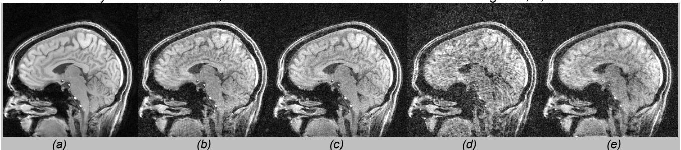
Fig. 3. FLORET images with R = (a) 1, (b,c) 4, and (d,e) 9 (scan time 2' 53", 58", and 26"). Images are reconstructed (a,b,d) without and (c,e) with CG-SENSE[3] using an 8-channel head coil (note there was no coil support for S/I unaliasing).

DATA: FLORET 3D trajectories were designed for a 240mm FOV with 1mm resolution, with ADC 4msec (TR 17 msec), to run on a GE 3T scanner. The inner 10% radius of k-space was critically sampled, then sampling was increased linearly to a radius of 30%, after which it was held constant for a resulting R=1, 4, \text{ and } 9 .