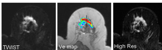
Fig 1. Morphological and pharmacokinetic data derived from the TWIST sequence allow lesion characterization. The morphological data is almost identical to the data derived from the High Res acquisition.

The SNR of the TWIST sequences was approximately 84% of the SNR of the high resolution acquisitions, which did not affect visual interpretation. Morphological analysis in the transversal plane was as good on the TWIST sequences as on the high resolution acquisitions. In all patients, the MRI could be interpreted on the basis of the TWIST sequences alone, using color maps of pharmacokinetic parameters and morphological characteristics (Fig 1). Moreover the creation of serial subtraction images and maximum intensity projections allowed good separation of lesions from normal enhancing glandular breast tissue (Fig 2). Presence of wash-out could not be evaluated because we did not perform TWIST acquisitions in the late phase of enhancement.