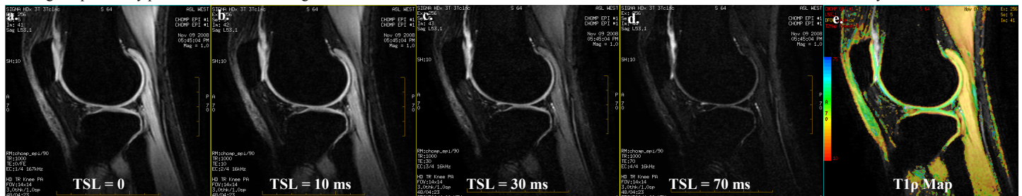
Fig 1. FOV: 14 cm; matrix: 256 x 200; slice thickness: 3 mm; 15 slices acquired; 10 shots; NSA: 4; ramp sampled, partial-ky, ASSET (R=2); scan time: 4 min 30 sec

Results The figures below show example in vivo T1ρ-weighted images (a-d) and their corresponding T1ρ maps (e). T1ρ values of the tissues imaged were within the range of previously published values. Cartilage: 35-55 ms. Muscle: 28-32 ms. Intervertebral discs: 75-110 ms. White matter: 65-75 ms. Grey matter: 85-110 ms.