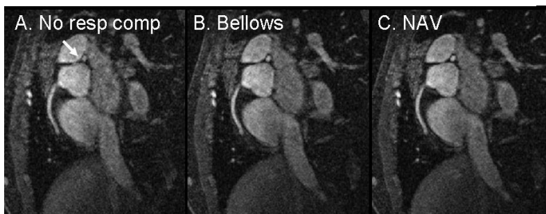
Figure 2: A slice from a 3D coronary MRI A) without respiratory gating, B) using bellows-gating, C) using retrospective NAV-gating.

Discussion and conclusions: Our preliminary study shows that the bellows is strongly correlated to diaphragmatic and heart motion, with greater correlation of the abdomen bellows than chest bellows. Our bellows-based reconstructions provide similar respiratory compensation to the NAV, but with a continuous signal which doesn't interrupt imaging. Our study which revisits the value of bellows-gating for respiratory compensation shows that bellows-gating is promising for cardiac MR.