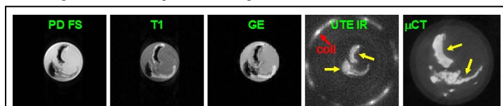
Fig 1 Imaging of a carotid sample with fat suppressed PD and T1-FSE, GE, UTE IR and micro-CT. Calcification appears as a signal void in all clinical sequences, and bright with UTE IR and micro-CT (yellow arrows).