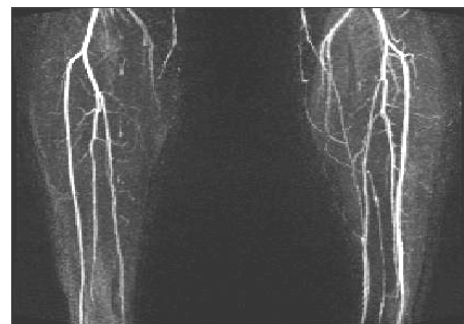
Figure 3: MIP of single frame of subtraction images.