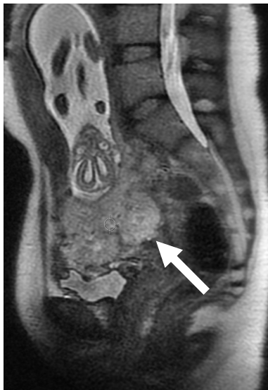
17 weeks of pregnancy Placenta previa and accreta ( Sag FIESTA TR/TE 4.3/1.9ms)

Conclusions: MR imaging proved to be appropriate in the management of pregnant patients with various abdominal pathologies. Unnecessary surgery was avoided in patients with clinically suspected acute abdominal conditions. MRI added to US in the evaluation of obstetric conditions requiring urgent management prior to delivery. In pregnant women with malignancy it was the modality of choice for staging and follow up.In summary MR imaging can be considered as a first-line cross sectional imaging method in pregnancy as an adjunct to US as it does not expose mother and fetus to unnecessary ionizing radiation.