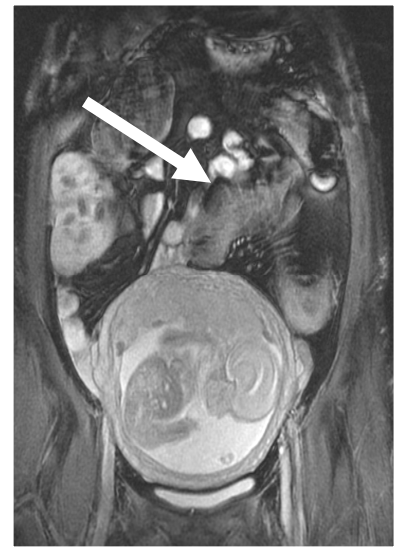
19weeks of pregnancy Crohn colitis (Cor FIESTA)