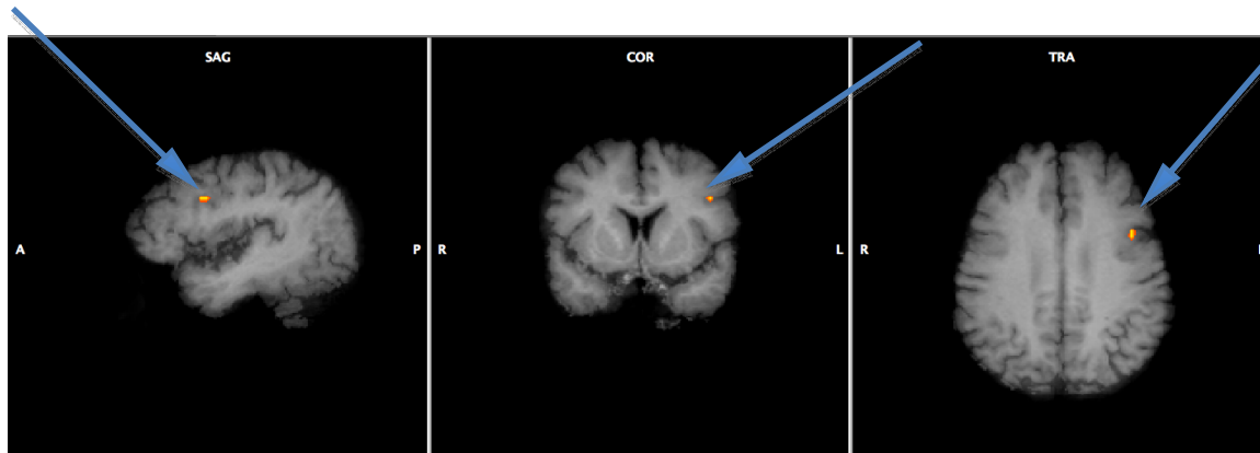
Figure 3. For display purposes, p<0.000024 . Brodmann Area 44, Talairach coordinates ( x=-42, y=8, z=31 )

Conclusions The left DLPFC is implicated in executive functioning, particularly in working memory. In this study, DLPFC was recruited during encoding of the word lists, and the level of recruitment was differentially modulated by strategy cueing in the TBI,