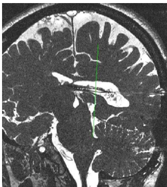
Fig 1. CISS image of the shunt. Green line indicates imaging plane.

In 3 of the 6 subjects, pulsatile flow was detected through the shunt. The diagnosis in the cases where no flow was detected was consistent with occluded shunt. Figure 1 shows a CISS image depicting the path of the shunt and the location of the imaging plane used for the cine phase contrast scan (green line). Figure 2 shows the volumetric flow rate waveform (2 cycles). The red and green arrows indicate onsets of arterial and CSF flows, respectively. Figure 3 shows the time integral over one cardiac cycle demonstrating the accumulated CSF volume flowing through the shunt. Peak systolic mean velocity and volumetric flows ranged from 9.6 to 20 mm/sec, and 0.42 to 0.99 mL/min, respectively. The accumulated volume ranged from 2.2 to 6 \mu L over one cardiac cycle. This is equivalent to about 0.14 to 0.35 mL/min, which is within the previously reported range for the supra-tentorial CSF production rate of 0.30 \pm 0.15 mL/min, measured by MRI [3].