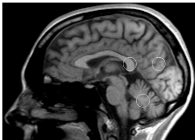
Fig 1: Location of voxels