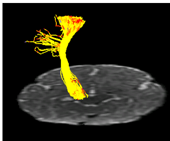
Fig 2: Coronal 3D view of the left motor pathway in a 3 month old. Connectivity is seen between a large portion of the motor cortex and the midbrain.