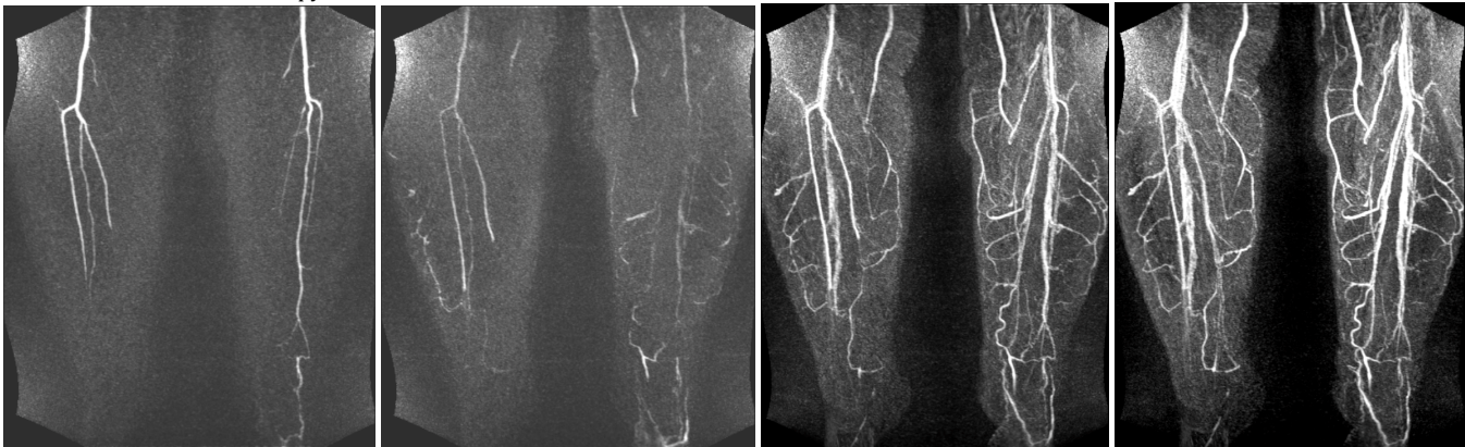
Figure 1: Calf images from a 58 year-old female with arterial thromboembolism to the right lower extremity. TWIST acquisition in (A) early and (B) late arterial phases. BC-CEMRA of the calves demonstrates venous contamination on both the (C) 1 st and (D) 2 nd acquisitions.

Conclusions: TWIST-MRA consistently obtained high-quality calf images, free of venous contamination compromising interpretation in all patients. This low dose technique enabled differentiation of collateral vessels and veins and demonstrated retrograde arterial filling. Despite a lower spatial resolution, the sensitivity for detecting significant stenosis was excellent with good agreement with the reference standard BC-CEMRA. TWIST-MRA is a useful addition to standard BC-CEMRA of the lower extremities. Further work is ongoing to evaluate the therapeutic impact of TWIST-MRA in choosing bypass targets and lesions for endovascular therapy.