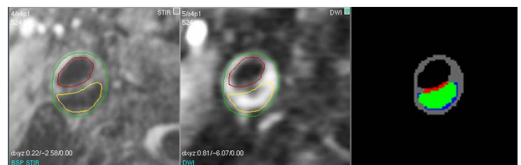
Figure 2: STIR and DWI images of a lipid lesion. Image at the right shows in green the overlap between the automatic and manual segmentation (red = false positive region, blue = false negative region).