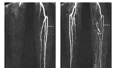
Fig 2: TWIST images of a patient with different times of complete enhancement of arteries of left (left image) and right (right image) leg. Arteries of right leg enhance 26 sec after that of left leg when significant venous contamination has already occurred in left leg. Signal from arteries of left leg is significantly lesser in the right image than the left image.