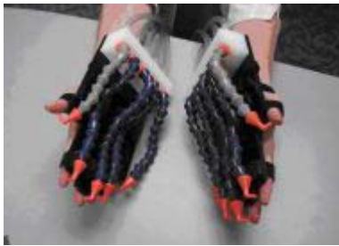
Figure 1 Pneumatic stimulators attached to subject's hands.

The system consists of 16 lengths of flexible tubing, each connected to a length of ¼ inch Loc-Line™ modular adjustable hose and terminated with a 1/16 inch diameter nozzle. The tubing is connected to a bank of high-speed solenoids (NVKF334, SMC Pneumatics, Indianapolis, IN) and enters the magnet room through a waveguide. A compressor provides pressurized air to the solenoids, which are computer controlled by a multifunction DAQ with clocked IO (PCI-6229, National Instruments, Austin, TX) and LabView™ software. The solenoids can be operated at frequencies of up to 10 Hz. Each of the 6 lines is connected to an adjustable-flow valve in order to regulate the air flow at each nozzle.