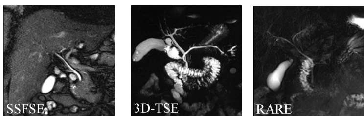
Figure 1: Most commonly used MRCP-sequences (without pathology)

High resolution 3D-TSE yields best results in detecting and correctly diagnosing ITBL in liver transplant patients with statistic better results than RARE-sequences. SSFSE is also highly effective in classifying the type of the stricture.