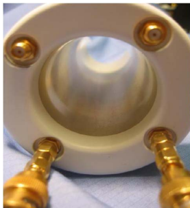
Fig.1 The 7T dual-tuned coil with 8 \lambda/2 resonators for ^1\text{H} channel and 8 \lambda/4 resonators for ^{13}\text{C} channel.

Acknowledgments This work was partially supported by NIH grants EB004453 and EB007588, QB3 Opportunity Award.