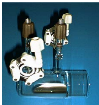
Fig.2 Rubidium enclosed in a Pyrex glass cell.