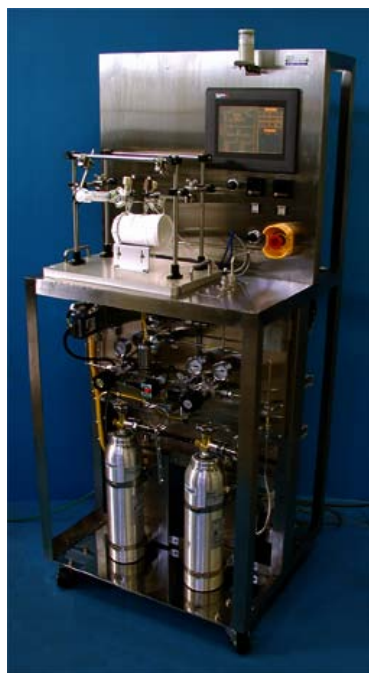
Fig.1 Practical device for the automated manufacture of hyperpolarized Xe gas.

We successfully developed a practical device that uses a batch method to provide a continuous supply of HP Xe gas with a sufficient rate of polarization for practical NMR/MRI experiments. This research should facilitate further work on NMR/MRI to shorten measurement times, obtain more diverse data, and increase its accuracy. The research should also facilitate the development of technologies suitable for biomedical applications including the instantaneous evaluation of lung functions, and of medical technologies for the early diagnosis and prevention of cerebral infarction based on high-accuracy and high-speed imaging of the blood flow in the brain.