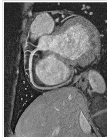
Fig 3: 3T Coronary MRA with FREEZE. Image acquired during the minimal myocardial motion interval computed by FREEZE (Resolution:0.34x0.35x1.5)