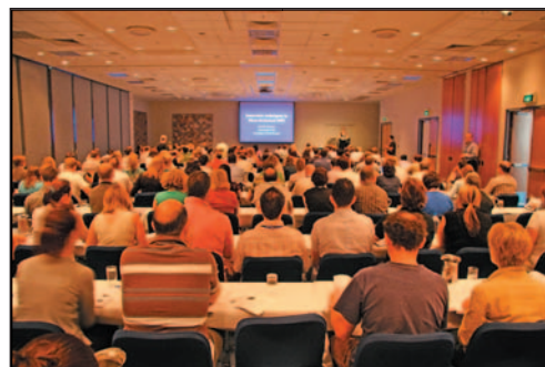
Full house at the Brisbane Convention and Exhibition Centre.

the speakers for generously donating their time and for making themselves so accessible to the attendees. The meeting would not have been successful without such a wonderful collection of experienced, dedicated and knowledgeable speakers. Of course, the seminar would not have been possible without the phenomenal support of our sponsors and we thank them all for continuing to support MR education in the Australia - New Zealand region. They are GE Healthcare, Siemens Medical Solutions, Philips Medical Systems, Queensland X-Ray, IMRSER, Regional Healthcare Group, Schering, and Tyco Healthcare. We look forward to seeing everyone at the 2007 Australia-New Zealand Regional Seminar in Melbourne, Victoria, Australia. ●