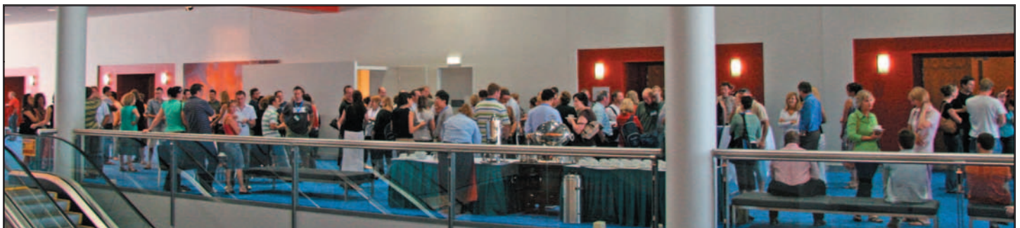
Registrants enjoying the morning break.

the speakers for generously donating their time and for making themselves so accessible to the attendees. The meeting would not have been successful without such a wonderful collection of experienced, dedicated and knowledgeable speakers. Of course, the seminar would not have been possible without the phenomenal support of our sponsors and we thank them all for continuing to support MR education in the Australia - New Zealand region. They are GE Healthcare, Siemens Medical Solutions, Philips Medical Systems, Queensland X-Ray, IMRSER, Regional Healthcare Group, Schering, and Tyco Healthcare. We look forward to seeing everyone at the 2007 Australia-New Zealand Regional Seminar in Melbourne, Victoria, Australia. ●