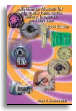
Reference Manual for Magnetic Resonance Safety, Implants, and Devices: 2010 Edition

Institute for Magnetic Resonance Safety, Education, and Research President, Shellock R & D Services, Inc.