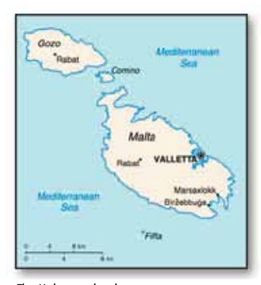
The Maltese archipelago

With this in mind, MMRRG has just applied for European funding under the Leonardo Scheme in order to send eight MRI radiographers to experience and learn about cardiac MRI and 3T imaging at the Oxford MRI Centre. In addition, MMRRG is organizing a series of lectures on research